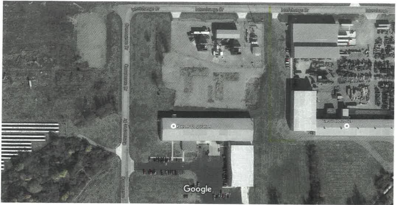
Imagery ©2016 Google, Map data ©2016 Google 100 ft